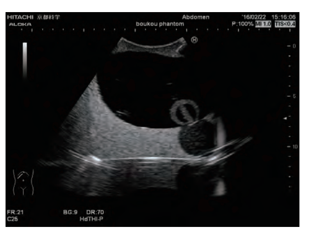
300m I urinary retention