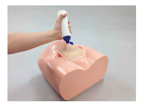
2. Spread lubricant gel on the phantom body.