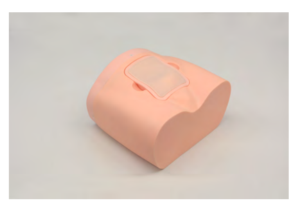
1. Set the phantom on the stable place.